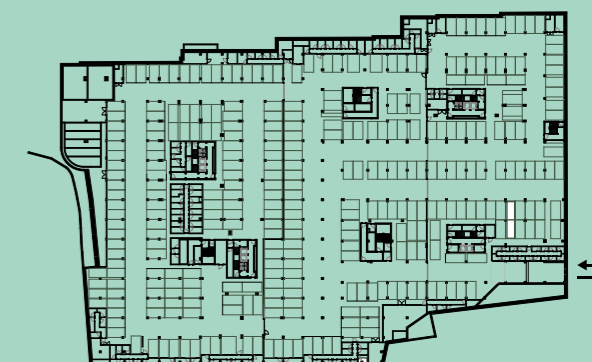
PLANTA PISO ESTACIONAMENTO -2 / PARKING FLOOR -2