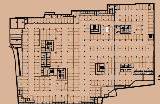
PLANTA PISO ESTACIONAMENTO -2 / PARKING FLOOR -2