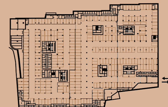
PLANTA PISO ESTACIONAMENTO -2 / PARKING FLOOR -2