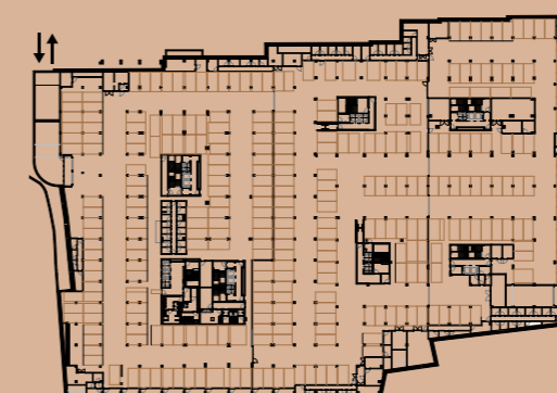
PLANTA PISO ESTACIONAMENTO -1 / PARKING FLOOR -1