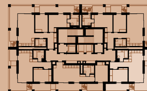
PLANTA PISO 13 | FLOOR PLAN 13

LUGARES DE ESTACIONAMENTO | PARKING UNITS 1