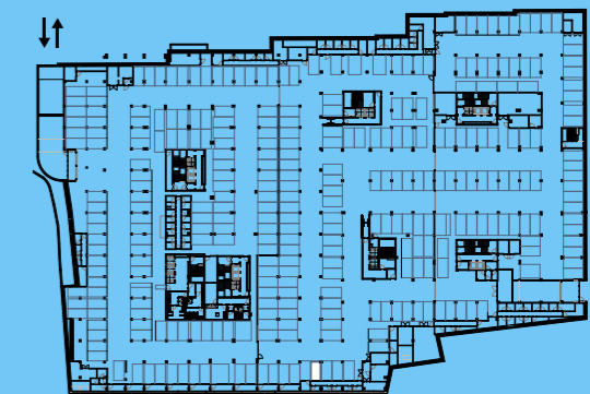
PLANTA PISO ESTACIONAMENTO -1 / PARKING FLOOR -1