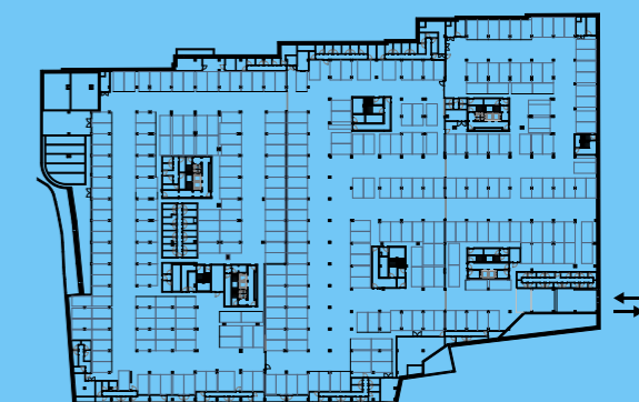
PLANTA PISO ESTACIONAMENTO -2 / PARKING FLOOR -2