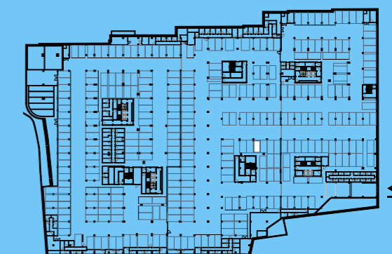
PLANTA PISO ESTACIONAMENTO -2 / PARKING FLOOR -2