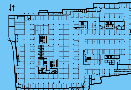
PLANTA PISO ESTACIONAMENTO -1 / PARKING FLOOR -1